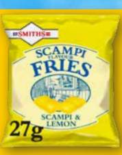
Smiths Scampi Fries 27g handy Pack