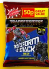
Transforma Beef 27g 50p PMP