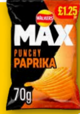
Walkers Max Paprika 70g £1.25 PMP