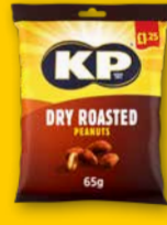
KP Dry Roasted P'nuts 65g £1.25 PMP