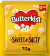
Butterkist Sweet & Salty 70g £1.25 PMP