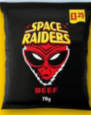
Space Raiders Beef 70g £1.25 PMP