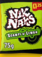
Nik Naks Scampi n Lemon 75g £1.25 PMP