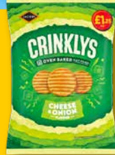
Crinklys Cheese & Onion 90g £1.25 PMP