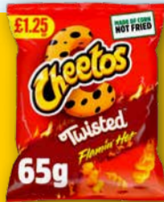
Cheetos Flamin Hot 65g £1.25 PMP