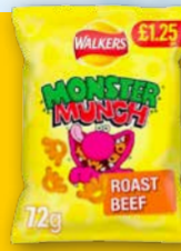
Monster Munch Beef 72g £1.25 PMP