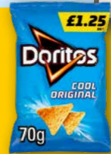
Doritos Cool Original 70g £1.25 PMP