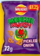
Monster Munch Onion 72g £1.25 PMP