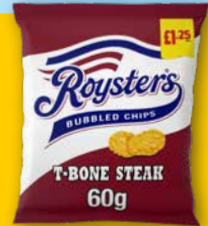
Roysters T-Bone Steak 60g £1.25 PMP