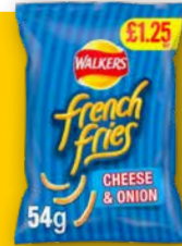
French Fries Cheese & Onion 70g £1.25 PMP