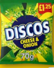
Discos Cheese & Onion 70g £1.25 PMP