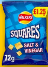
Squares Salt & Vinegar 72g £1.25 PMP