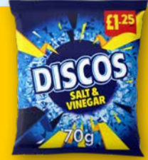
Discos Salt & Vinegar 70g £1.25 PMP