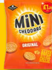
Mini Cheddars 90g £1.25 PMP