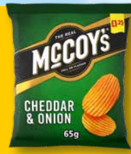
McCoy's Cheese & Onion 65g £1.25 PMP